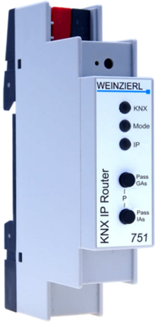
Photo of the device

Compact bus powered Router between LAN/Ethernet and KNX bus